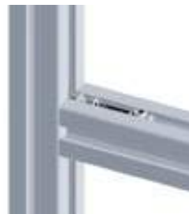
Fräsverbinder Profil 30 Milling Connector Profile 30