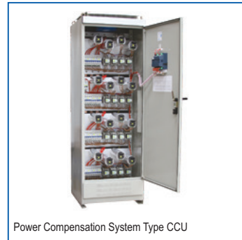
Power Compensation System Type CCU