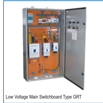
Low Voltage Main Switchboard Type GRT